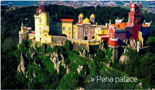
» Pena palace