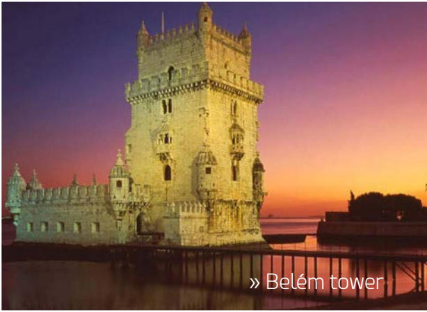
» Belém tower