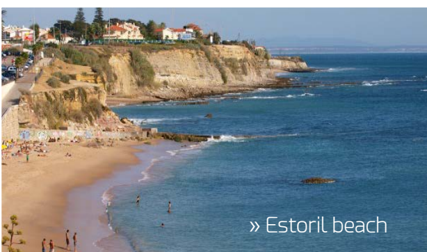
» Estoril beach