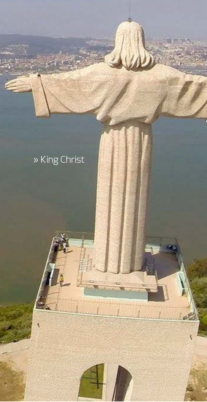
» King Christ